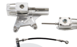
Milled Aluminum Rear Quick System (Chain Adjuster, Rear Caliper Bracket, Brake Hose) ¥69,000.-

※The standard swingarm needs to be modified in order to install our rear quick system.