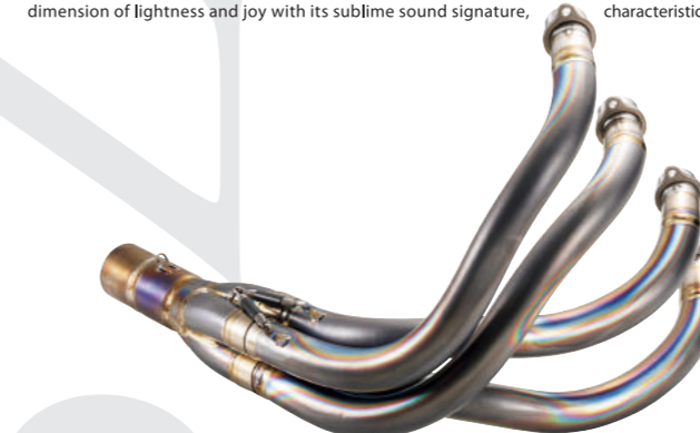
Hand Bend Titanium Exhaust System 4 into 1, Straight Silencer, Incl. Catalizer ¥330,000.-

The hand-bend 4 into 1 exhaust system is equipped with a build-in catalyzer, made from only 0.7 mm thin titanium pipes and various other titanium parts (including flanges, collars, silencer). It constitutes a new dimension of lightness and joy with its sublime sound signature, characteristic to titanium.