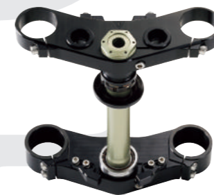
Milled Aluminum Fork Bridge [Triple Trees] (Variable Offset 35/40mm) Silver ¥195,000.- Black ¥200,000.-

Swapping to the JB-POWER Fork Bridge (triple trees) leads to neutral handling and increased riding stability, providing a sense of control, to fully enjoy yourself. Because Fork Bridge and Step (rear set) are variable, they can be easily adjusted to the situation and the riders' preference.