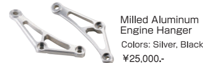
Milled Aluminum Engine Hanger Colors: Silver, Black ¥25,000.-