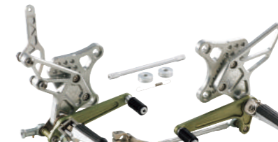
Milled Aluminum Riding Step Kit [Rear Set] Colors: Silver, Black ¥100,000.-

※The genuine head light bracket needs to be modified in order to install the JB-POWER one.