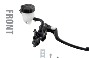
NISSIN Brake Master Cylinder ¥20,000.-

Although the genuine brake system is equipped with enough braking power and no change seems necessary, changing the rear brake layout massively improved the overall brake force balance and the rear quick systems greatly enhances maintainability.