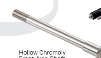
Hollow Chromoly Front Axle Shaft ¥15,000.-

Improved stiffness and rigidity result in more information being transferred to the rider, leading to a direct feeling. Combined with the increased shock absorption of MAGTAN forged magnesium wheels a synergy effect leads to lighter and more stable cornering, giving you total peace of mind.