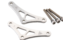
Milled Aluminum Rear Suspension Link Plates (L/R) Colors: Silver, Black ¥20,000.-

※The standard front fork needs to be modified in order to install our fender bracket.