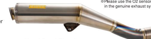
Hand Bend Titanium Exhaust System 4 into 1, Angled Megaphone Silencer, Incl. Catalizer ¥330,000.-

※Race use only. ※Please use the O2 sensor which is installed in the genuine exhaust system.