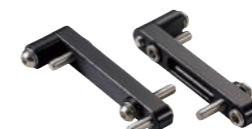
Milled Aluminum Fender Bracket ¥15,000.-

※The standard front fork needs to be modified in order to install our fender bracket.