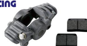
AP-RACING Brake Caliper CP2696 ¥62,000.-