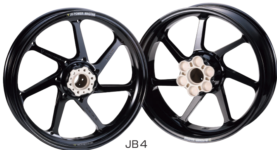
JB4 MAGTAN Forged Magnesium Wheel Set ¥350,000.-

Changing to 18-inch wheels not only improved the stability yet transformed the Z900RS into an entirely new motorcycle which is pure riding pleasure in a wide range of applications from urban riding to touring. Our 18-inch MAGTAN wheels are about 30% lighter than the genuine wheels, obliterating the 17-inch wheels biggest advantage.