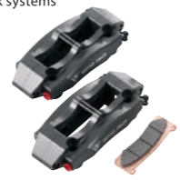
Radial Mount Brake Caliper 6POT [Brake Pads included] 1PCS ¥98,000.-

GOODRIDGE Stainless Mesh Hose / EARL's Stainless Fitting 1PCS ¥11,000.-