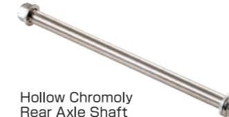
Hollow Chromoly Rear Axle Shaft